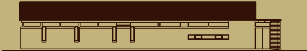
EAST AND WEST ELEVATION

These particulars and attachments have been prepared in good faith to give a fair overview of the properties. The areas are a guide only and not precise. These particulars will not be binding on the sellers and should not be relied upon.